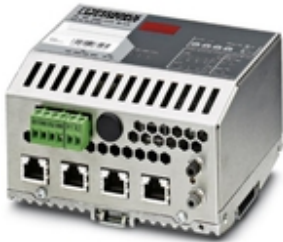
Proxy for PROFINET-RT, G4 functionality, INTERBUS proxy for fiber optics with integrated 4-port switch

Please be informed that the data shown in this PDF Document is generated from our Online Catalog. Please find the complete data in the user's documentation. Our General Terms of Use for Downloads are valid ( http://phoenixcontact.com/download )